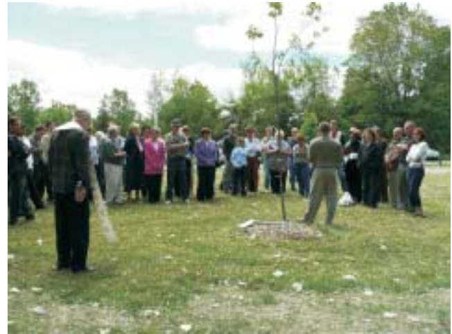
A great turnout for the event.