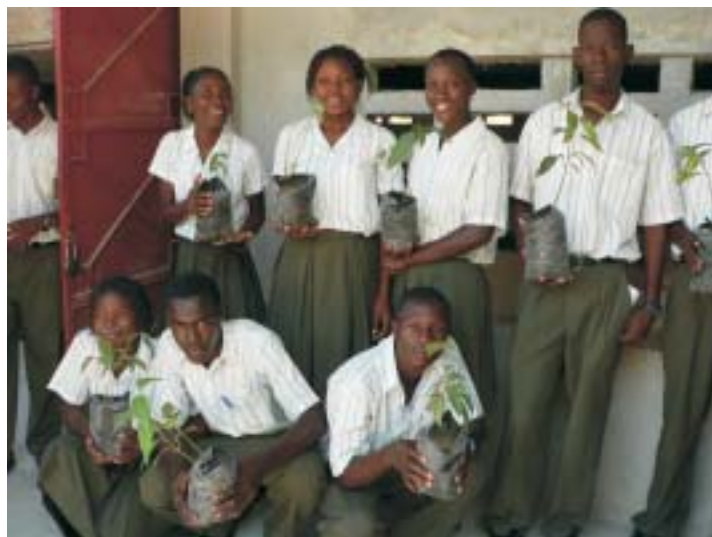
St Patrick's students with their chosen trees to take home, plant & nurture.

I apologized to her for my naive North American view that the problem of reforestation could be solved by simply planting a million trees in 5 years. She said we may well do so – but this way we involve the people and empower them to plant and look after their own chosen trees. Was I humbled !!!! yet inspired by the prospect of thousands of people excited about planting trees. Isn't that what development's all about???